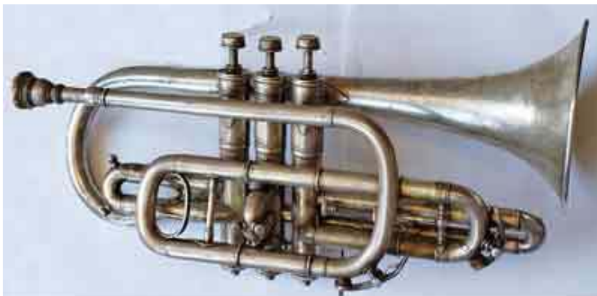
Photo 6 shows another example of this model. The photos here are from Horn-u-copia.net or auction sales.

Compare this Lamoreaux cornet #11061 below with the B&F version at right (photo 4); this also matches the catalog illustration shown in photo 1.